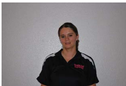
Head Coach 11U