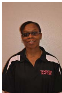
Head Coach 15's