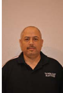
Head Coach 13's