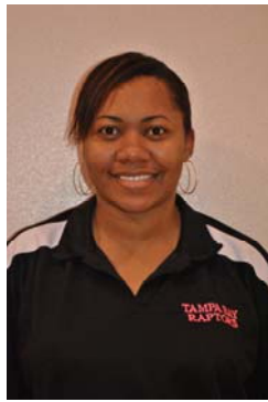
Head Coach 18's